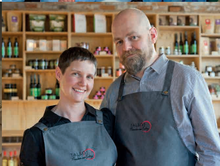
Above: Talbot Provedore and Eatery

87A Napier Street, Maryborough (03) 4410 7060 www.wdea.org.au